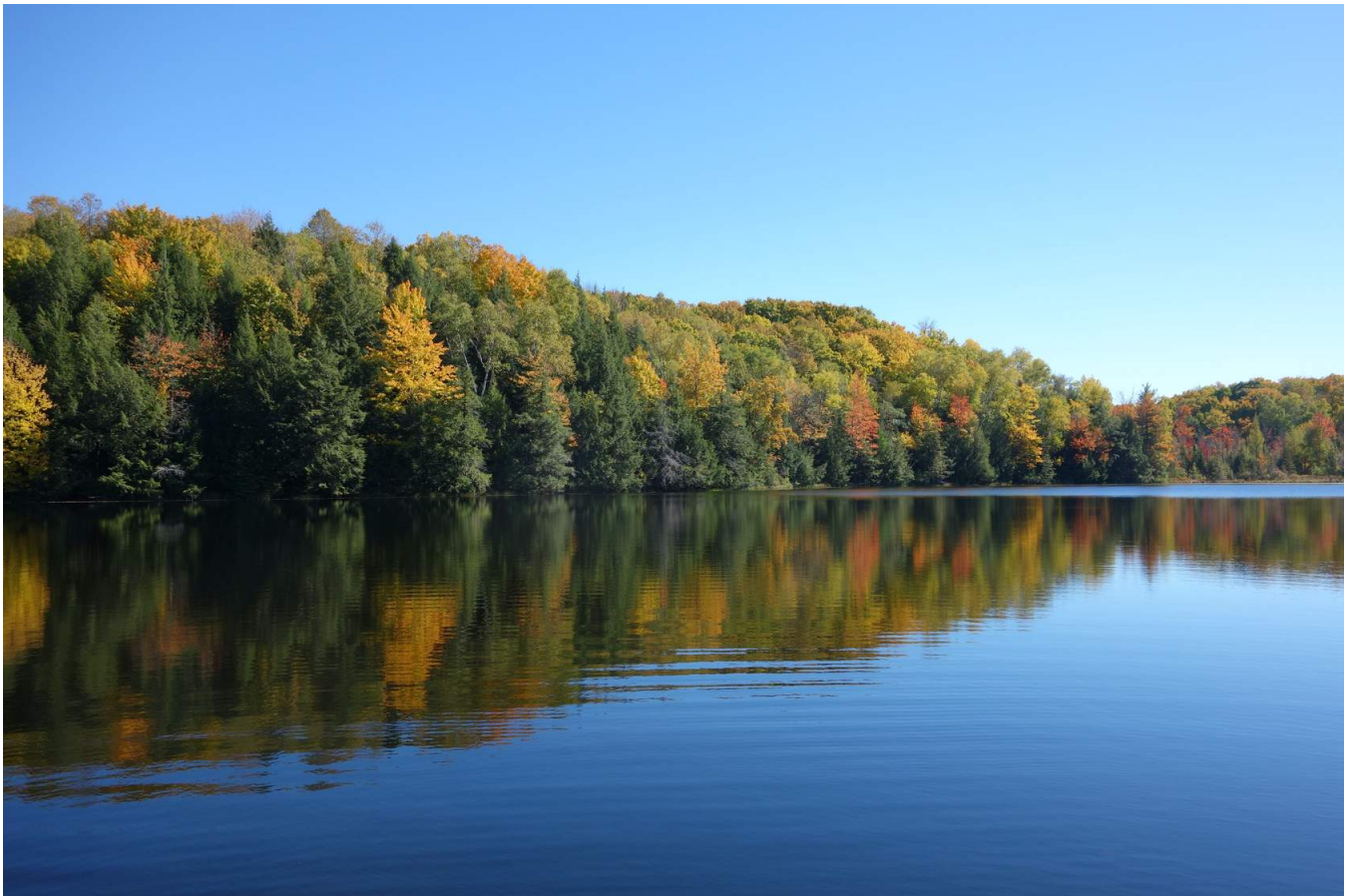
Picture of lake