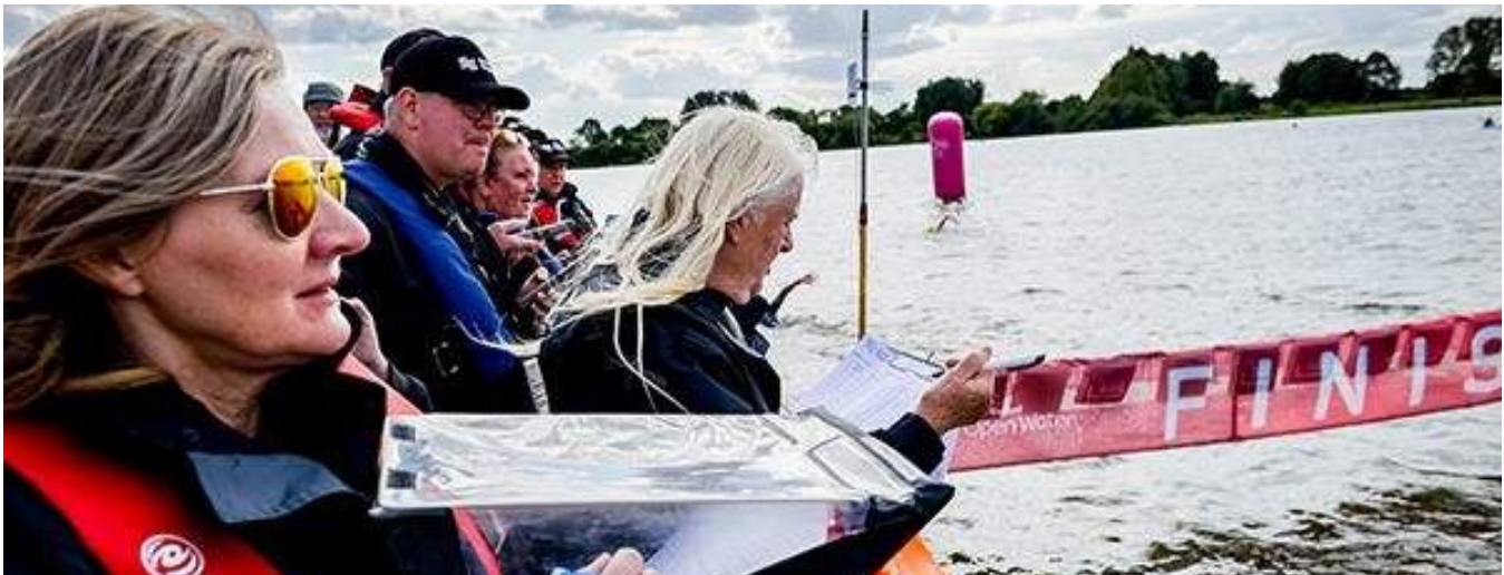
Picture of Officials at finish line