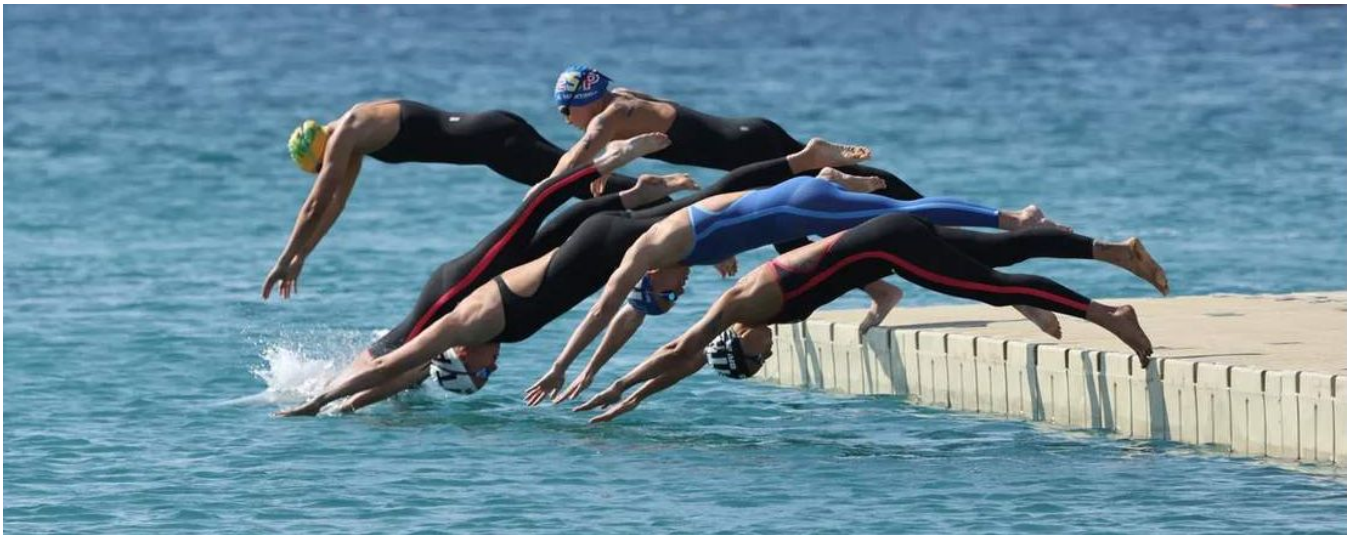
Picture of Race start