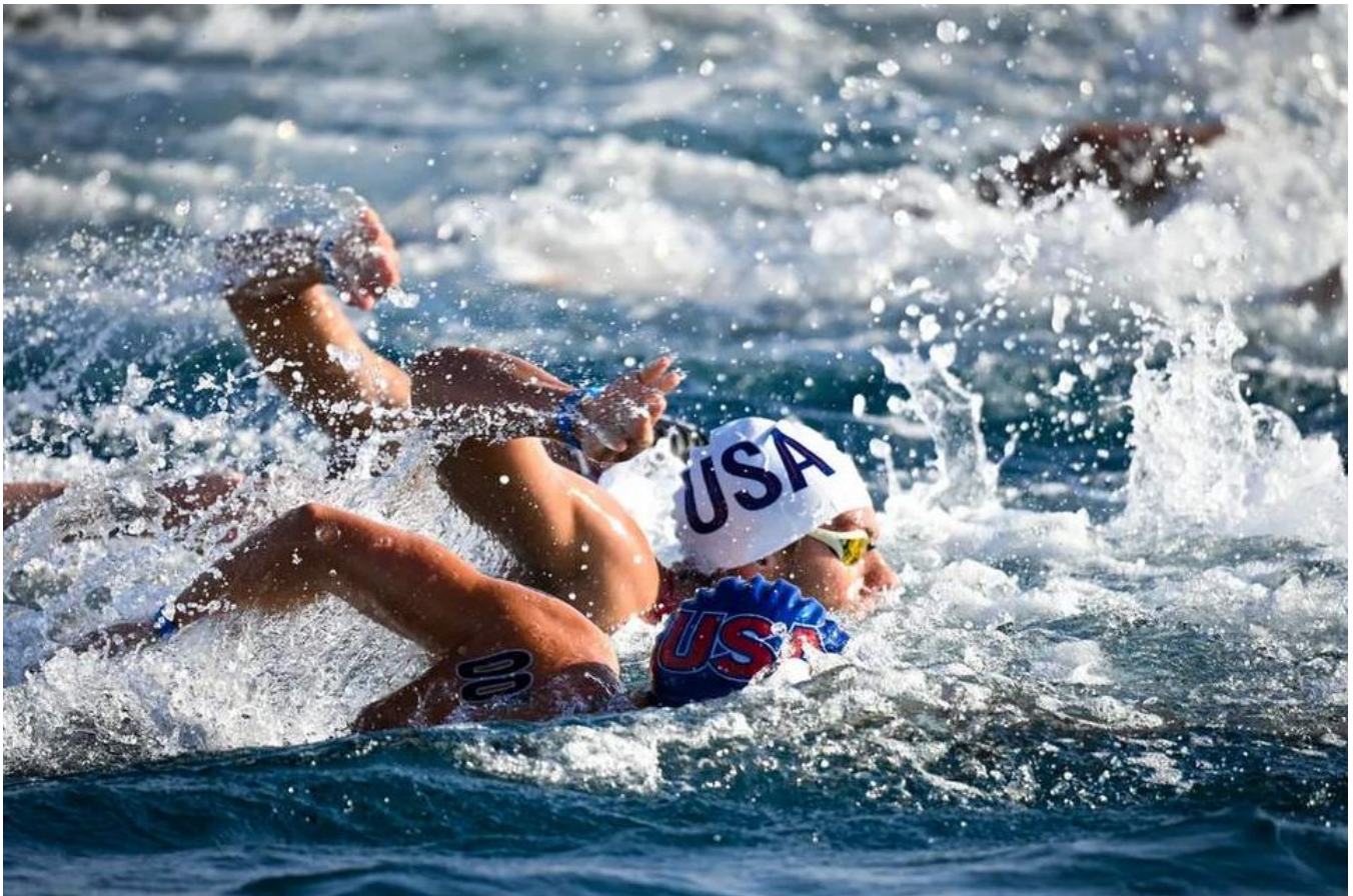
Picture of swimmers competing