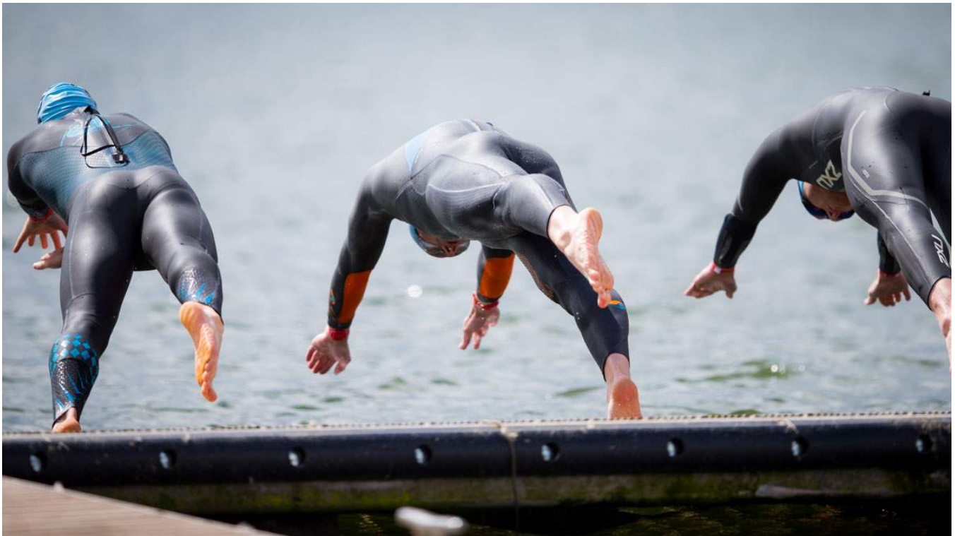
Picture of Open Water Swimmers Wearing wetsuits