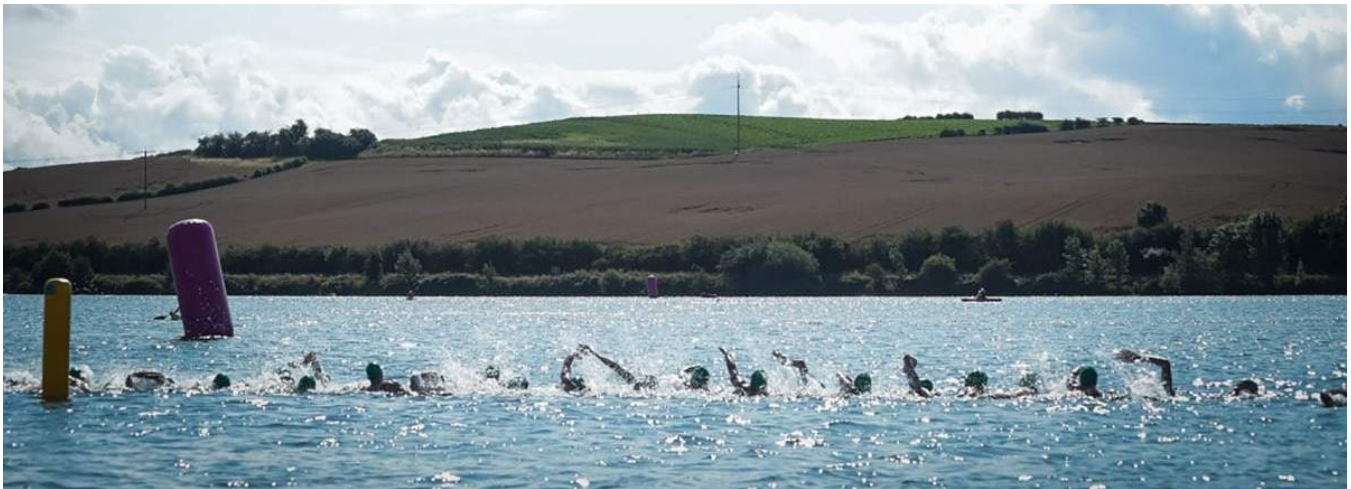
Picture of Open Water Venue with Swimmers Swimming

The Facilities Rules are intended to provide the best possible environment for competitive use and training. These Rules are not intended to govern issues related to the general public. It is the responsibility of the owner or controller of a facility to provide supervision for activities undertaken by the general public.