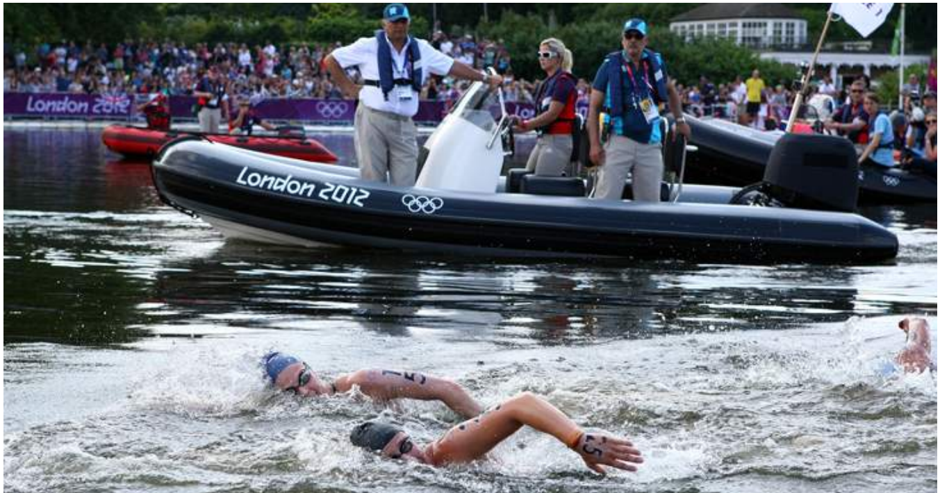
Picture Safety boat